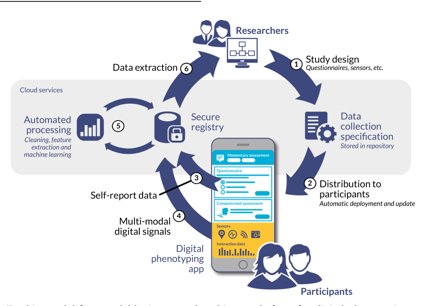
Fig. 2 Black Dog Institute/Deakin model for a scalable, integrated multi-user platform for digital phenotyping research Figures and letters refer to those shown in the diagram. In this model, (1) researchers specify the study design, define which questionnaires and sensors are required to deliver a digital phenotyping study (and optionally how these are integrated with any intervention components, such as self-guided therapy.) This specification is then hosted alongside others in a secure online repository. When each study coordination tool that acts to coordinate data collection, a bespoke, study-specific data collection app, or a hybrid data collection intervention. Collected (3) self-report (e.g. questionnaires and mementary assessments) and (4) digital data (e.g. sensor measurements and device interaction data) is uploaded automatically to a secure online registry. Platform modules automatically manage potential barriers to data collection, such as user battery life and limited connectivity, through smart scheduling and caching. Automated processing pipeline (5) normalizes and converts raw data into standardized intermediate features and labelled outputs using machine learning. Researchers can start to extract registry data (6) as soon as it is received, accelerating analysis, permitting study designs that involve expert feedback, and allowing any data collection issues to be identified and addressed early in the research process. Rights management enables future researchers to request from users' access to previously-collected data

algorithms so that they can be replicated. Development of shared repositories for digital phenotyping will also require consideration of ethics issues, secure storage, linkage potential and logistical issues of exchange potentially large datasets securely across different jurisdictions. At the simplest level, collaboration could involve the development of working groups that work to harmonize data collection and reporting to expedite replication and scale-up studies. Nevertheless, we think that more significant value will be realized by being able to combine and pool data for reuse. Recognizing this opportunity, in Australia, a multi-center consortium is being assembled to develop a large-scale phenotyping databank. The Black Dog Institute and the Applied Artificial Intelligence Institute (A2I2) at Deakin University are building a hybrid data collection platform and data repository that will permit multiple primary and secondary analysis studies to be conducted on shared infrastructure (Fig. 2).