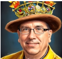
Avatar created on RIMINI

As you probably know my podcast became written, audio and video, this year. This is blog #552, audio episode #187, and video #21. No wonder I don’t publish weekly anymore. Too much work! My most listened to episode was May 22nd Burnout, Healthy Habits, American College of Lifestyle Medicine (109 downloads) and most watched, Aug 20th Playing Baritone Saxophone with Disabilities. Can Be Done! 115 video views and 52 downloads