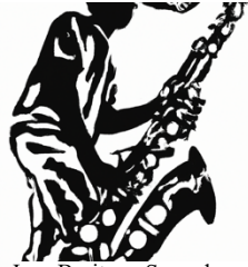
Jazz Baritone Saxophone in style of Kara Walke https://labs.openai.com/e/sgimC5lsgZBWobq2ZlgFQD1i/aDAs9Tgmuk4yfhdAk0aBtkLh